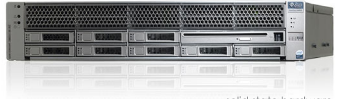
solid state hardware