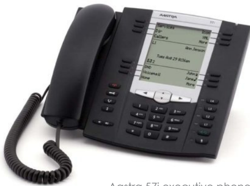
Aastra 57i executive phone